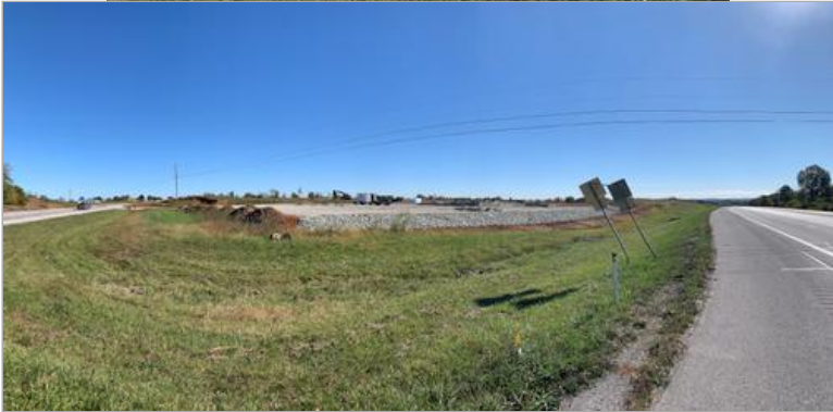
Meadows Park Pano.jpg